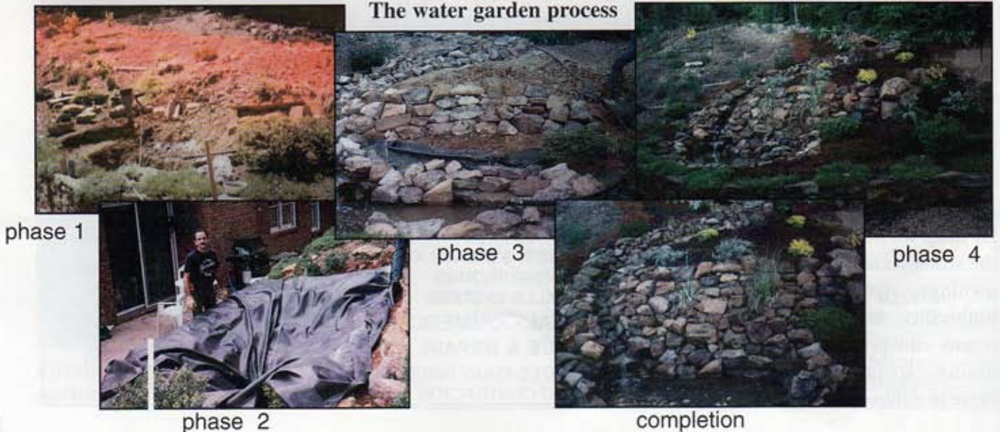
The water garden process

"If you want a tiled in, out-door fish bowl... call your pool guy" says Tharpe; "If you want